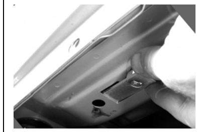
Fig 4 Driver side front shown