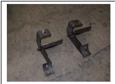
Fig 1 Passenger side brackets