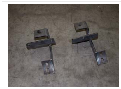
Fig 2 Driver side brackets

For Technical Support/Warranty Information please call 310-762-9944