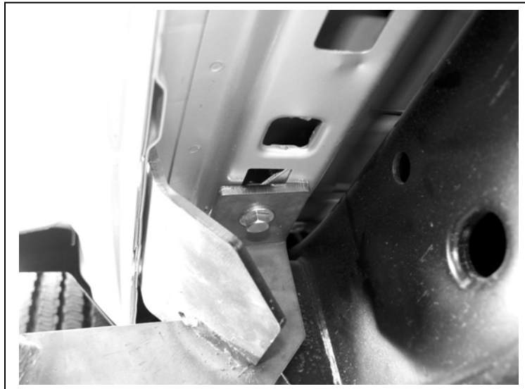
Fig 5 driver side front bracket shown