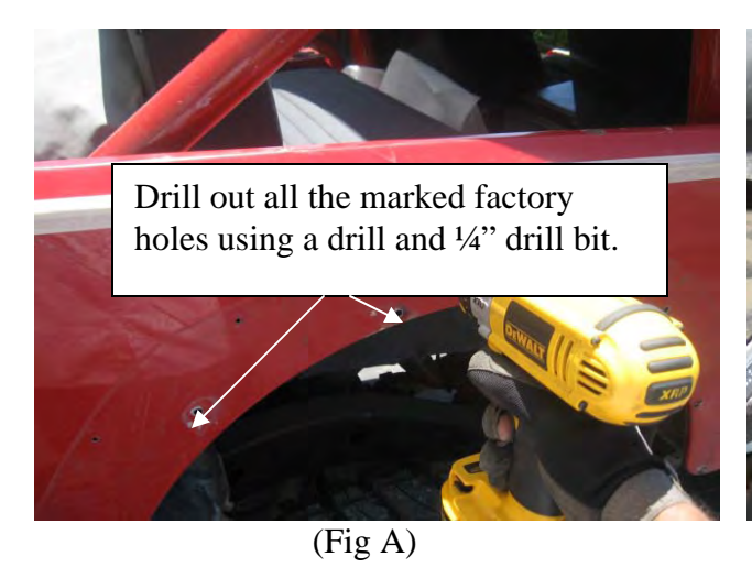
STEP 3: Drill out the marked holes using a drill with a '4" bit. (12-TJ, 10-YJ's) Fig A

STEP 2: Position flare on body tub. Line up the holes in the flare with the existing holes in the body tub. Using a scribe or marker make a small mark on the holes that will be used. Set flare to the side.