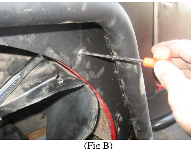
STEP 4: Insert bolts through flare and jeep body and hand tighten with lock nuts. Fig B (You may need to pull inner fender liner down to gain access to the back of the bolts to install the nuts) Fig C