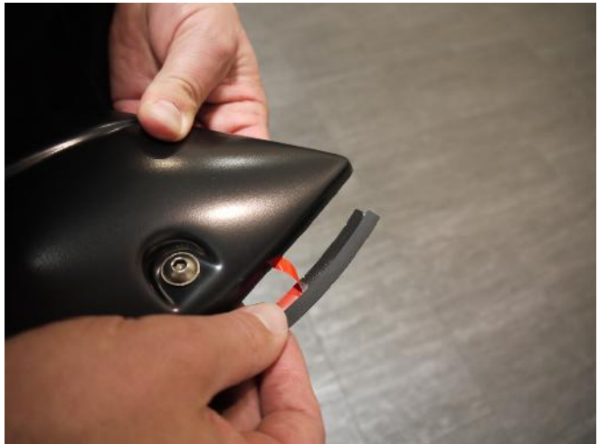
STEP 2: Attach the included rubber seal to the Fender Flares. Peel back 2" of the adhesive backing and position on the Fender Flare. Attach the seal to the Fender Flare, peeling back a few inches at a time. Attach rubber seal along all areas the Fender Flare will make contact with the vehicle body.

For Technical Support/Warranty Information please call 310-762-9944