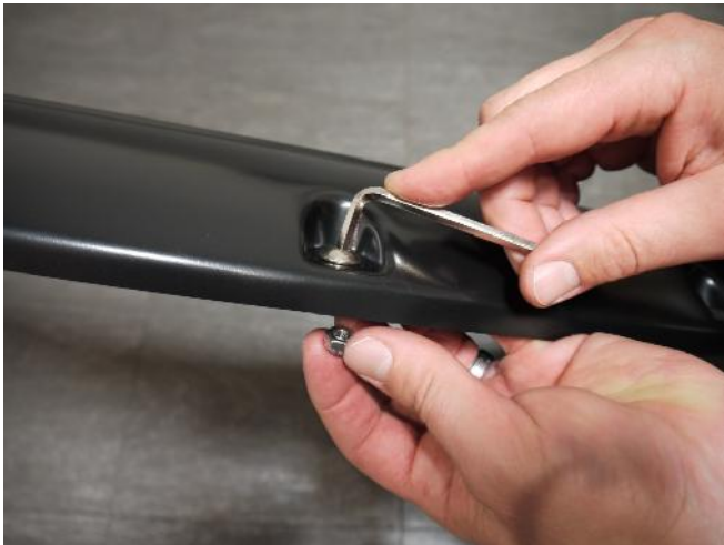
STEP 1: Attach 9 bolts to each Fender Flare using a 5/32" Allen key and a 3/8" wrench/socket. (wrench/socket and Allen key not supplied)

PAINTING INSTRUCTIONS – If Fender Flares are being painted; do not install edge extrusion until painting is complete. Prior to painting, clean all surfaces to be painted using clean water and a mild detergent, do not use lacquer thinner or any solvent based products. Wipe completely dry. Best results will be achieved by wiping the areas to be painted with a tack rag just prior to painting. Most automotive paints can be applied directly to the Fender Flares, however some may require a primer (check paint manufacturer specifications). Good adhesion will be achieved without sanding. Select a paint (and primer if necessary) that is suitable for rigid plastics PMMA (Acrylic). If using a paint system that requires baking, do not expose the product to temperatures above 70°C (158°F). Do not fit the extrusion or any of the hardware to the Fender Flares until the paint is completely dry.